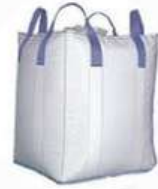
PP- RAFFIA /BIG BAG