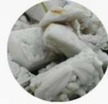
LDPE - LUMPS RIGID MATERIAL