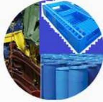
HDPE -PP RIGID MATERIAL